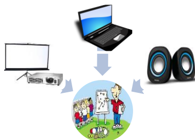
Figure 1. Media used in socialization of teaching style of physical education teacher.

The actual fact at the moment is physical education teachers do not yet understand the teaching style of physical education in elementary school. Through audio visual media teachers can learn the various learning styles easily. Audio visual is a set of media that can be used to facilitate the understanding in revealing the materials. The use of this audio visual can be applied by teacher in introducing material related to teaching style of physical education. The importance of the use of audio visual in introducing material, it can stimulate memory to be stronger and facilitate in making program related to material which will be explained [1].